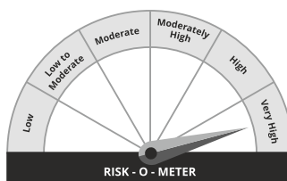
Scheme Risk O Meter

RISK - O - METER Investors understand that their principal will be at Very High Risk